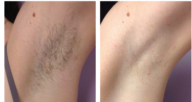
Skin Type II | 4 months post 3 tx