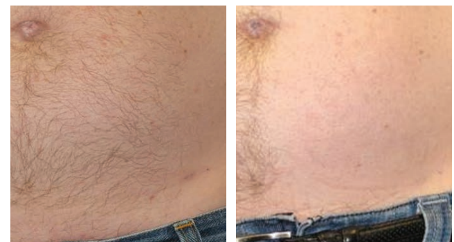
Skin Type II | 2 months post 3 tx