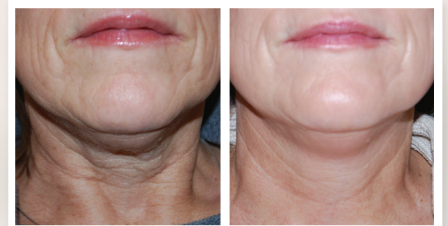
8 months post 6 treatments